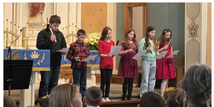
“God Loves Me Dearly” played by fifth and sixth graders before the program.

Closing song of the Christmas program: “God Loves Me Dearly”.