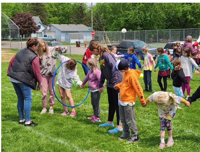
The obstacle course for chapel families.

Thanks to the teachers, 5-8 grade helpers, the PTL, and all the parents and grandparents and special friends that helped to make Field Day 23 a great day, despite the chilly temperature!