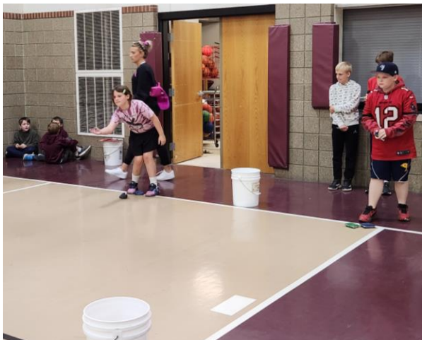
Bean bag toss for third grade.