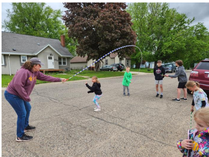
Jump rope for kindergarten.