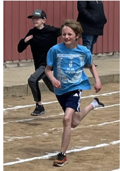
On the track