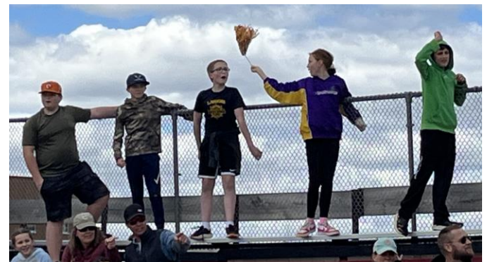
Cheering classmates on!