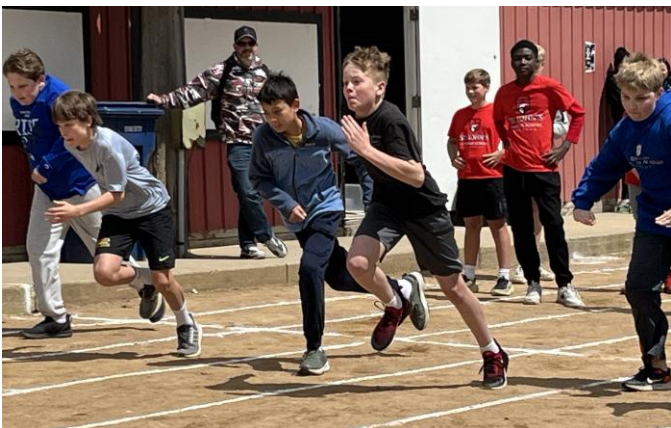
On your mark, get set, go!