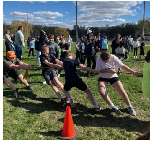
Tug of war action