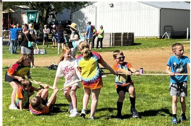
Third grade showing their strength in the tug of war.