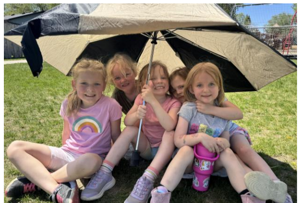
Preschool girls enjoying the day.