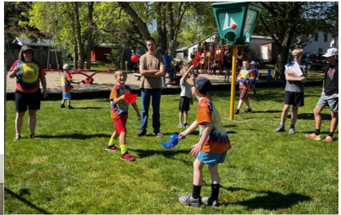
Second graders at the scoops toss station.