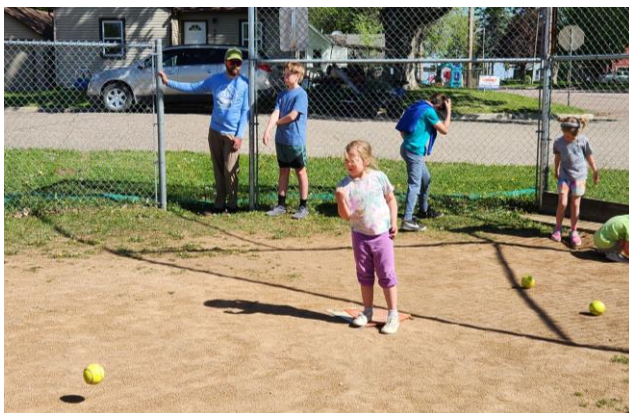
Kindergarten accuracy throw event.