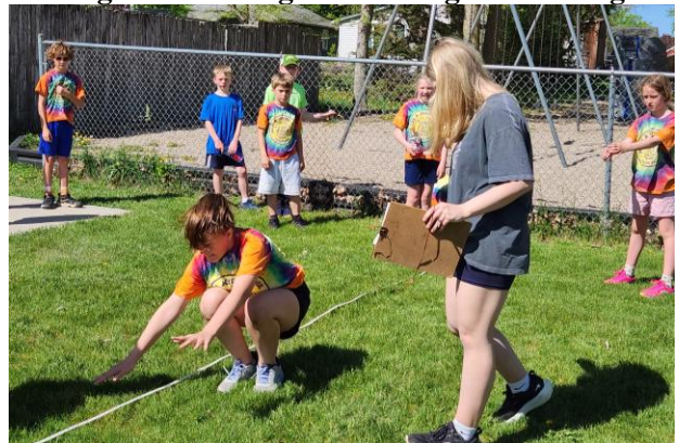
Triple jump by the fourth grade.

The eighth grade band members receiving their special recognition for five years of dedicated musicianship.